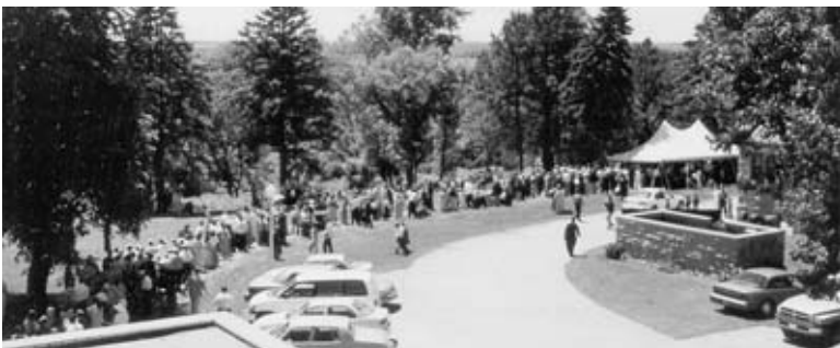
This view from the Seminary roof shows the faithful waiting patiently in line to pick up their meal after the ceremony.