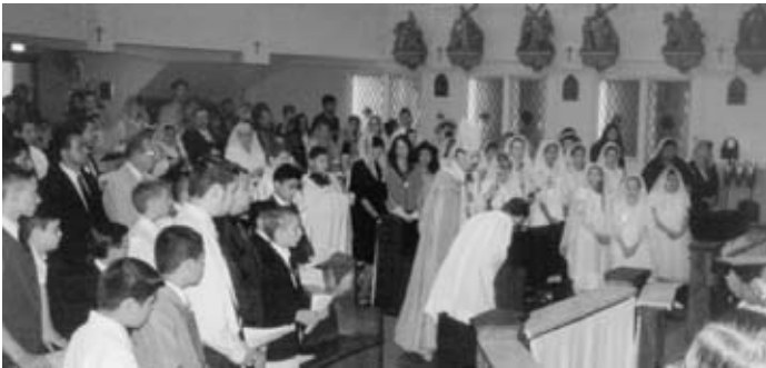
The bishop enters the church for the ceremony of Confirmation. This photo shows the 26 confirmands and their sponsors in the front rows, the girls and women on the gospel side and the boys and men on the epistle side.

Since it was also the Solemnity of Corpus Christi, the bishop led the public procession of the Blessed Sacrament that followed Mass, showing in practice the new confirmands how to be soldiers for Our Lord really present in the Blessed Eucharist.