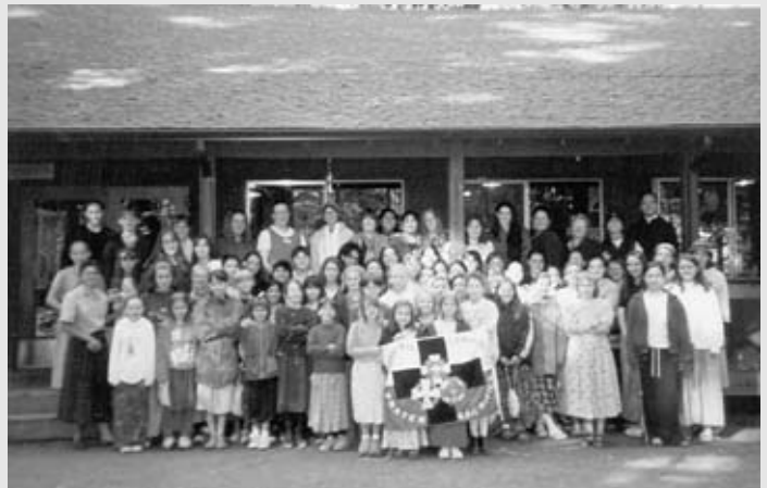
Father, the counselors and the campers in front of the main pavilion, together with the Eucharistic Crusade banner which gave the motto for the camp.