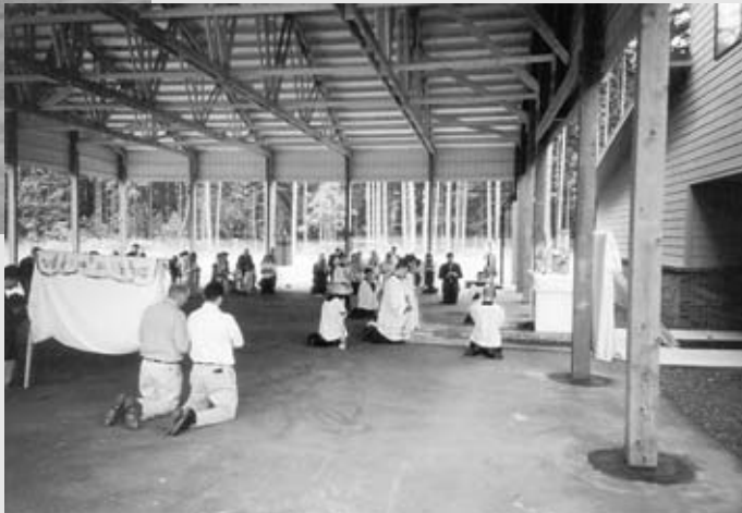
Consecration of the parish to the Sacred Heart of Jesus on Sunday June 24, Solemnity of the Sacred Heart, on an outdoor altar set up in the outdoor gym built for the children's recreation, especially during the winter time.