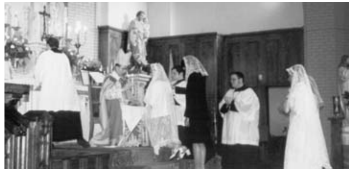
The administration of the matter and form of the sacrament by the bishop on the predella before the main altar.