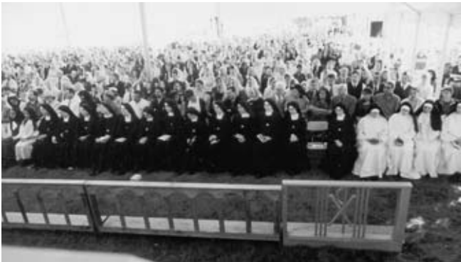
The crowd in attendance at the ordinations ceremony, flowing out from all sides of the tent, with the sisters in front.