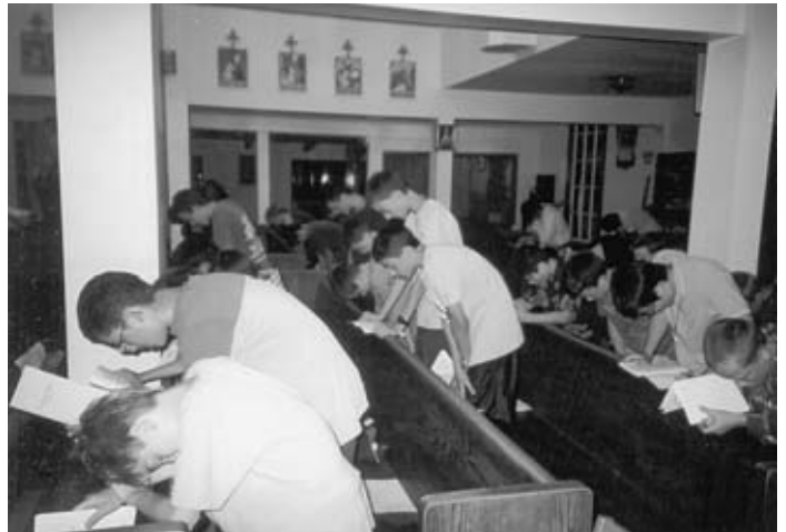
Campers at the boys' camp in July all learnt to recite the office of Compline with the priests. Here they are bowing profoundly for the recitation of the Confiteor .