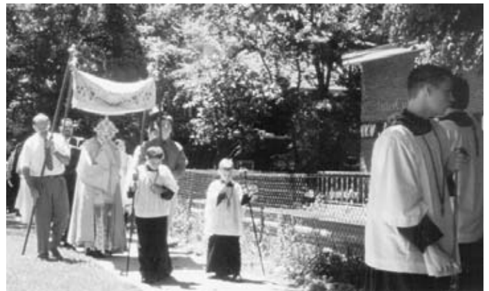
The bishop takes the Blessed Sacrament through the neighboring streets.