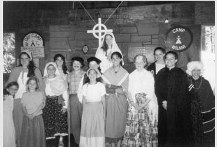
The girls who performed the play on St. Bernadette.