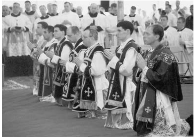
The seven newly ordained priests attentive while the bishop prays for them during the ceremony.