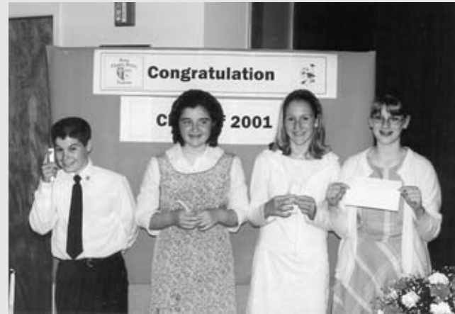
The month of June started with the ceremony of 8th grade graduation. The four graduates will be continuing their high school at the Academy.