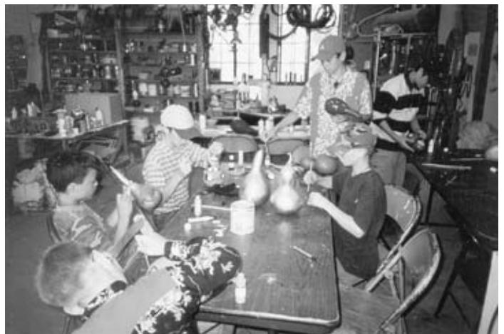
Boys paint gourds during the arts and crafts class.