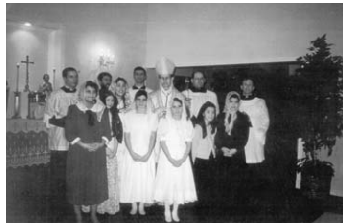
The bishop together with the altar boys and seven confirmands in front of the altar that had been set up for the Holy Sacrifice of the Mass.