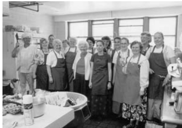
Behind the scenes in the kitchen. The chef together with the ladies that made the meal happen for the 200 invitees in the refectory and for the 1,100 faithful who ate outside.