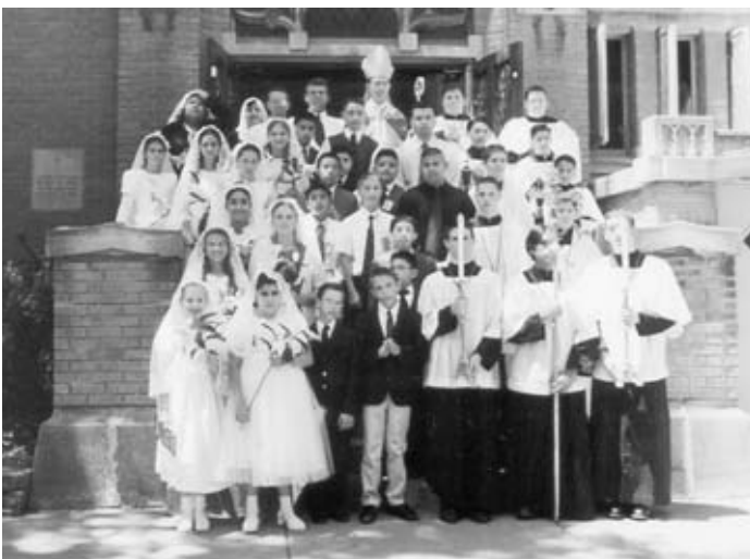
The bishop, altar boys and confirmands on the front steps of the church.