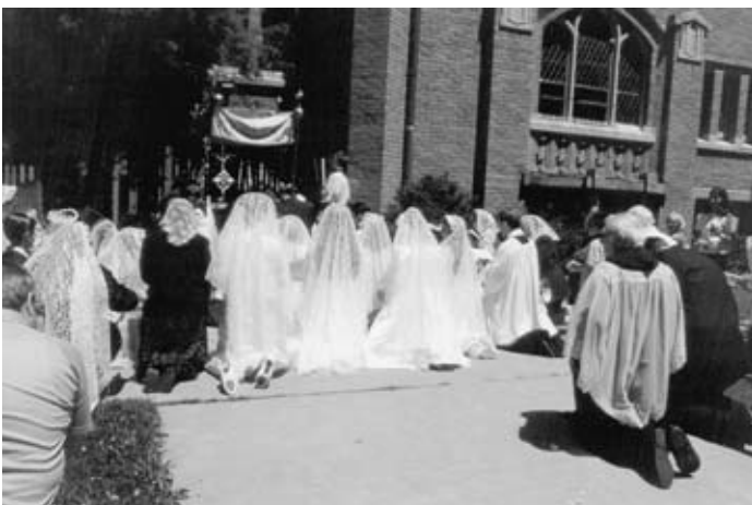
Confirmands and parishioners kneel in adoration before the Blessed Sacrament at an outdoor altar set up for Benediction.